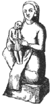
Catholic image or Pagan Babylonian image?

Although difficult reading, this book accurately provides a fascinating historical in-depth examination of the shocking similarities between the practices of ancient Babylonian religion and those of today's Roman Catholic church.